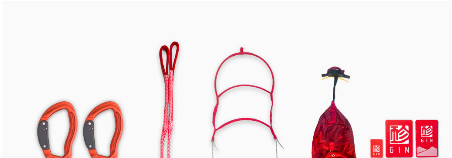
AustriAlpin Rocket carabiner